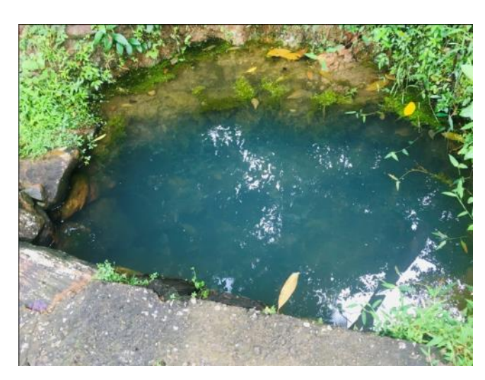
Water source for the pipeline